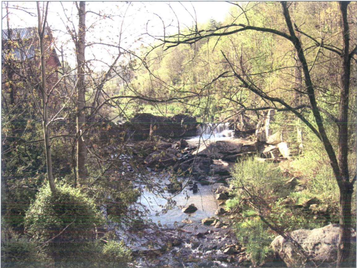
Photograph 1 – Location of dam (looking upstream).