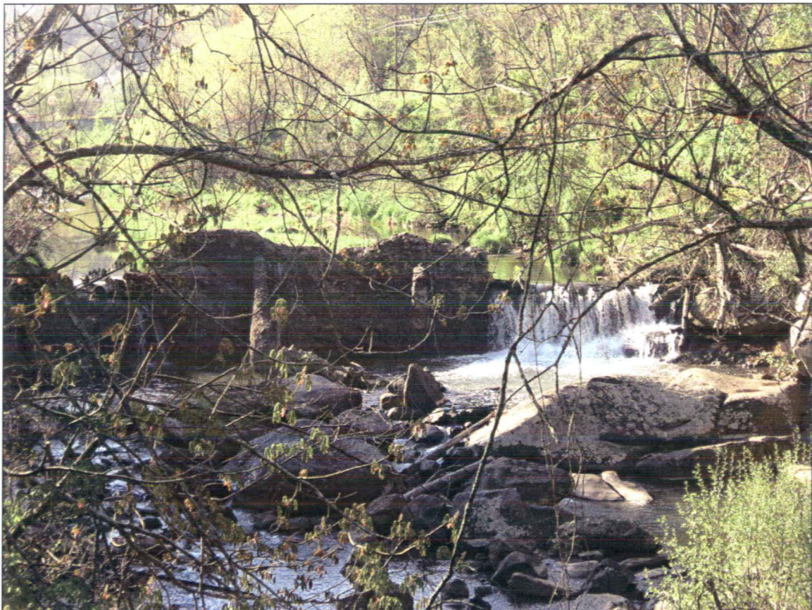
Photograph 2 – Close-up of dam (looking upstream).